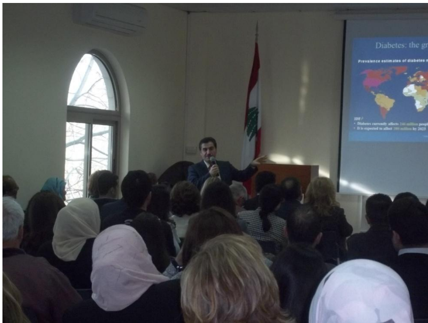
Steps to A Healthier you- Seminar 2