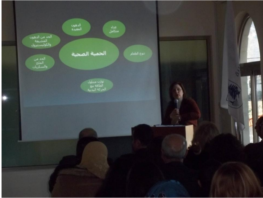
Steps to A Healthier you- Seminar 1