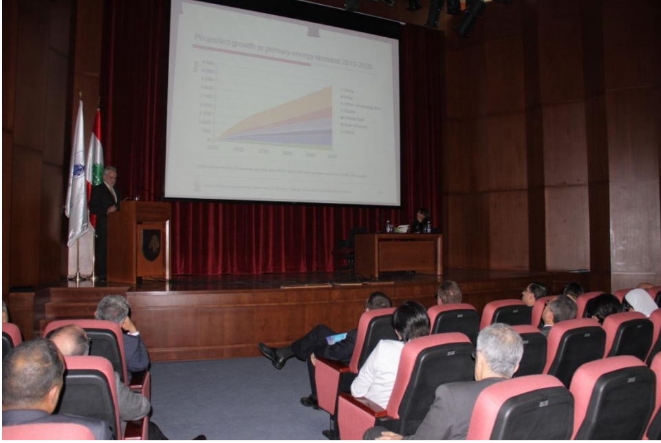
Coordinator Visit of PROMETHEAS Network