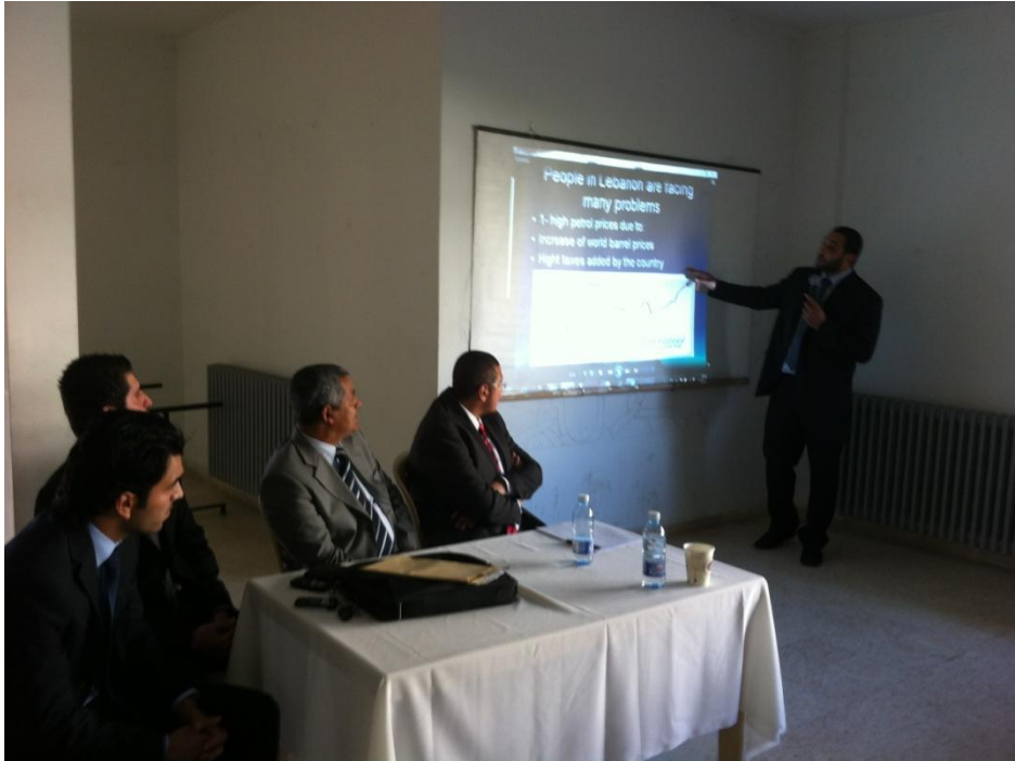
Student Project Seminar- Faculty of Engineering