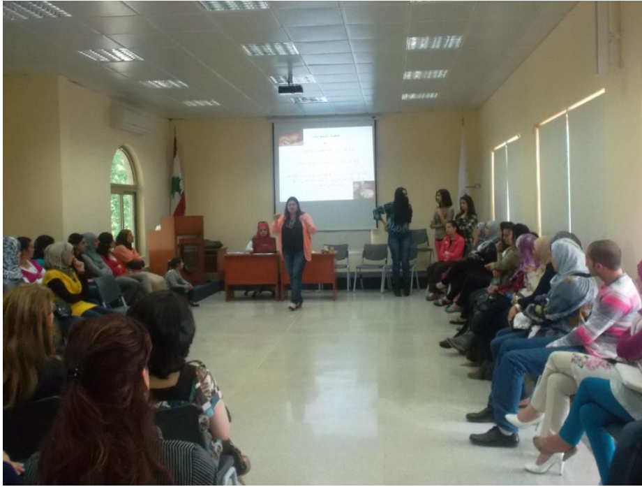
Steps to A Healthier you- Seminar 3