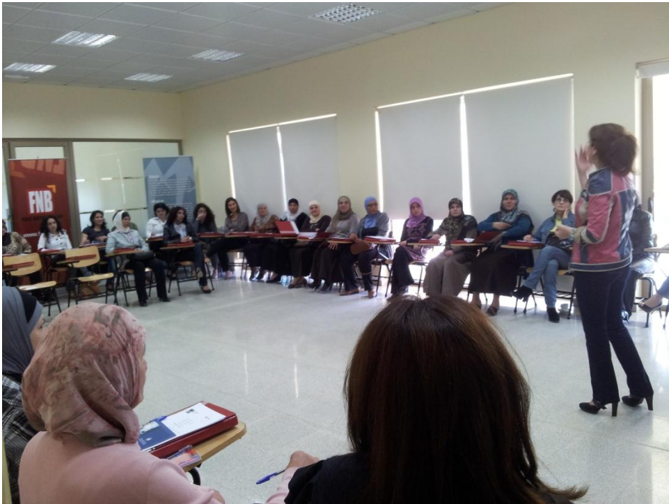
ورشة عمل "كيف أنشئ مشروع صغير"