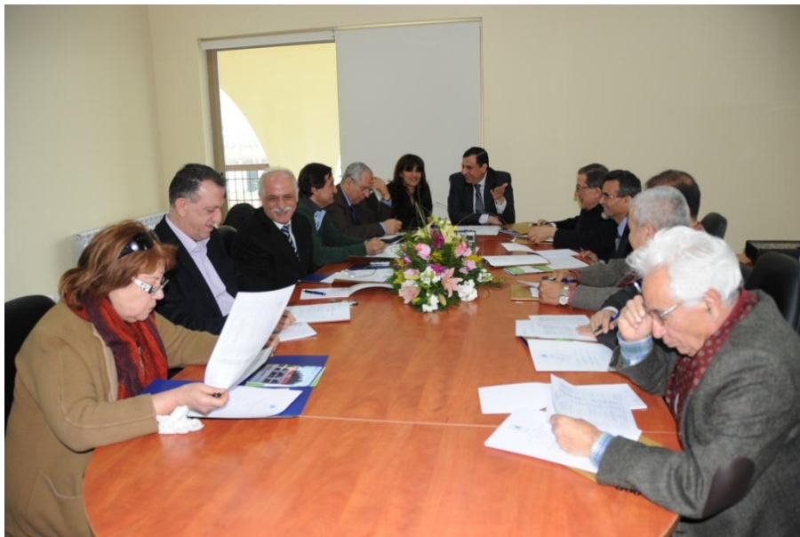
Managing Board First Meeting