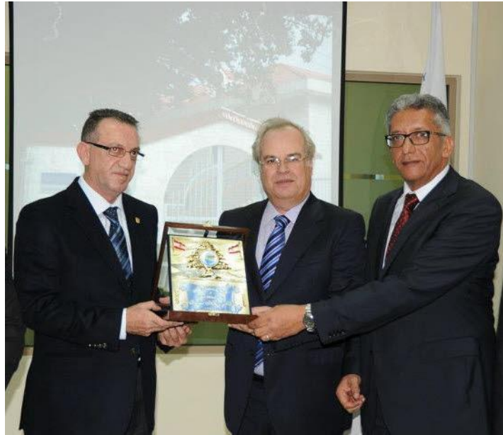
Bekaa Governor's Visit

It is noteworthy to state that all the aforementioned activities are archived by individual reports including photos. Some photos of various events and activities are shown below: