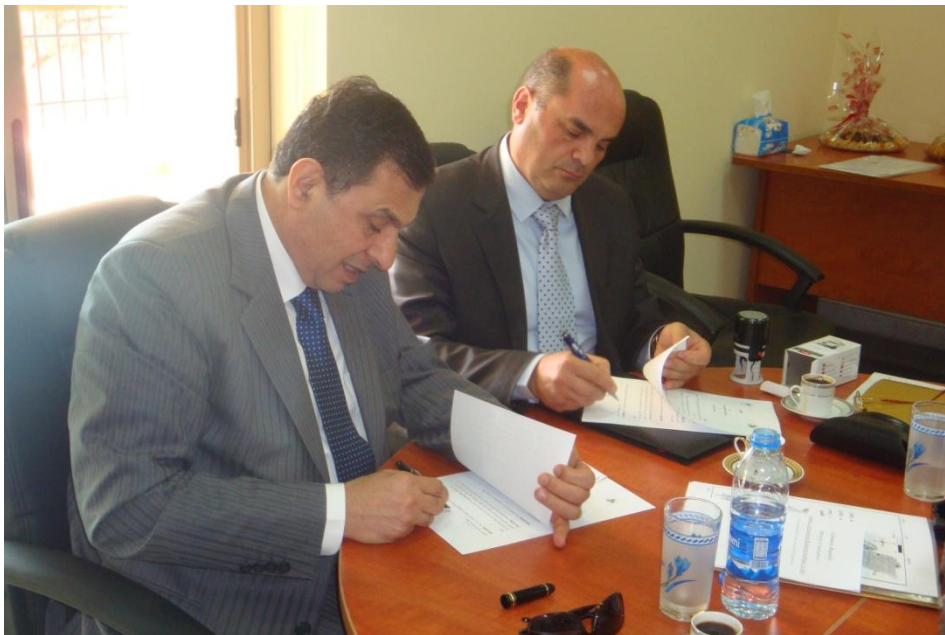
Memorandum of Understanding with LARI